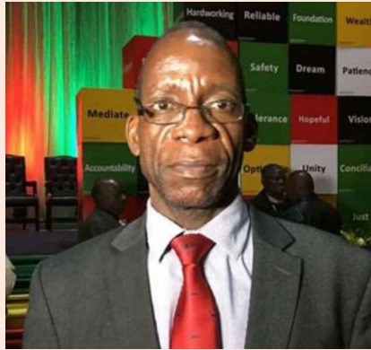
Lovemore Madhuku - National Constitutional Assembly (NCA)