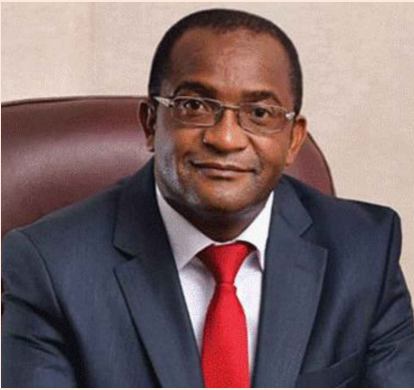
Douglas Mwonzora - Movement for Democratic Change (MDC)