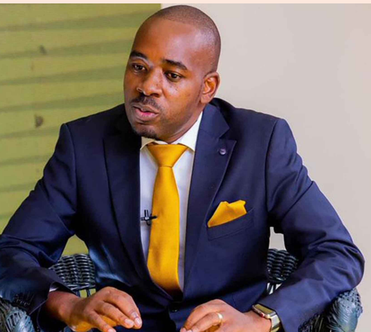
CCC leader - Nelson Chamisa

Here is a full list of the Citizens' Coalition for Change's (CCC) prospective National Assembly candidates whose names were submitted for nomination ahead of the August 2023 general elections.