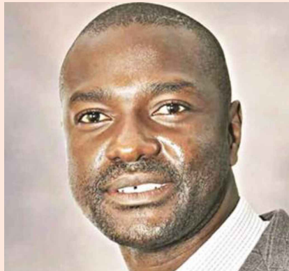
Trust Chikohora - Zimbabwe Coalition for Peace and Development (ZCPD)