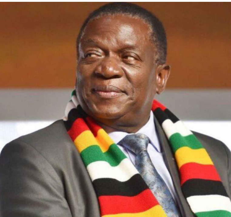
ZANU PF Leader - Emmerson Mnangagwa

The list includes names of party representatives for National Assembly, Senate and Women's Quota elections.