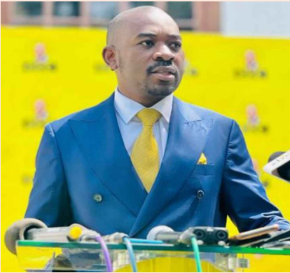
Nelson Chamisa - Citizens Coalition for Change (CCC)