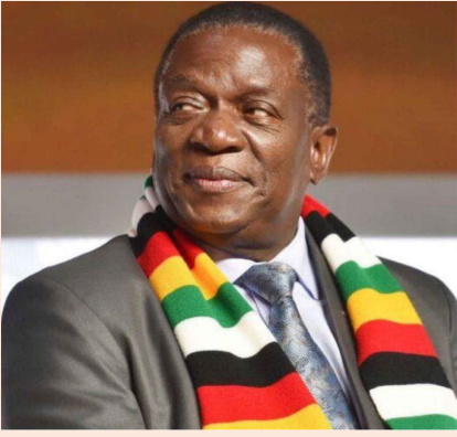
Emmerson D. Mnangagwa - ZANU PF